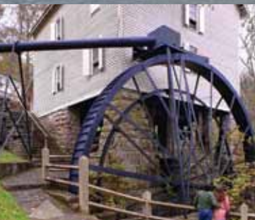
MILL SPRINGS MILL