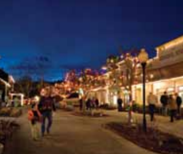
RENFRO VALLEY ENTERTAINMENT CENTER

There are wonderful places to visit within an hour's drive of Somerset and Pulaski County. Country music fans will appreciate RENFRO VALLEY, home of the world famous Barn Dance Show. Lights are abundant during the Christmas season. Visit BIG SOUTH FORK SCENIC RAILWAY in historic Stearns, where you can take a 16-mile round-trip train ride. The guides at Sheltoewe Trace Outfitters (near CUMBERLAND FALLS), make whitewater rafting, canoeing or kayaking on the forks of the Cumberland River an outdoor water adventure worth remembering. See the world's largest overshot waterwheel in action at MILL SPRINGS MILL.